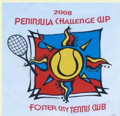
All players received a commemorative T-Shirt.

On one of the hottest June weekends on record, the 2008 Peninsula Challenge Cup played out over 3 days and was deemed a grand success by players and spectators!